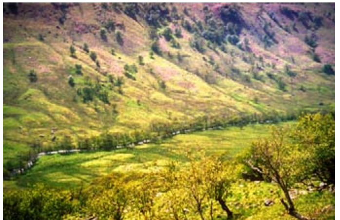
Glen Finglas, The Groddach

Over one million trees have been planted on the estate, creating 404 ha of new woodland. A further 20 ha have naturally regenerated, mainly within the deer fenced areas on Lendrick Hill and Glen Meann West. While natural tree regeneration is preferable,