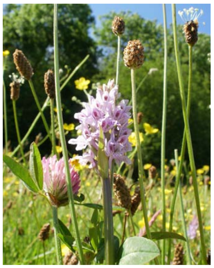
Green Castle, Orchid

The Woodland Trust's Green Castle Woods, Carmarthenshire, has fields whose history and pattern dates back to 1779.