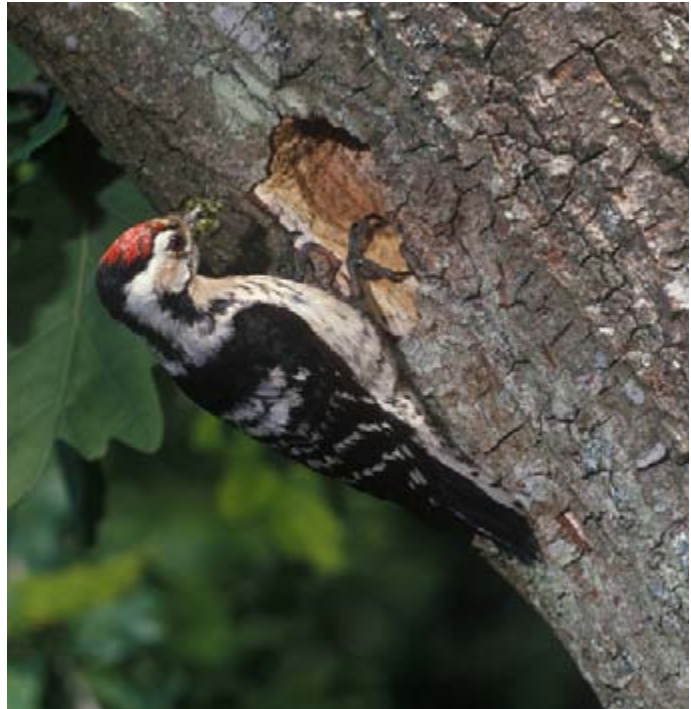
Lesser Spotted Woodpecker

It is a rather forgotten habitat, but recently there has been increasing interest in the restoration and continuation of wood pasture sites.