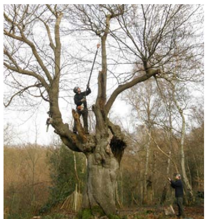
Reduction of an old lapsed pollard.

Excessive desiccation was experienced by a small number of oak pollards in the initial stages of the work, due to the removal of too much surrounding