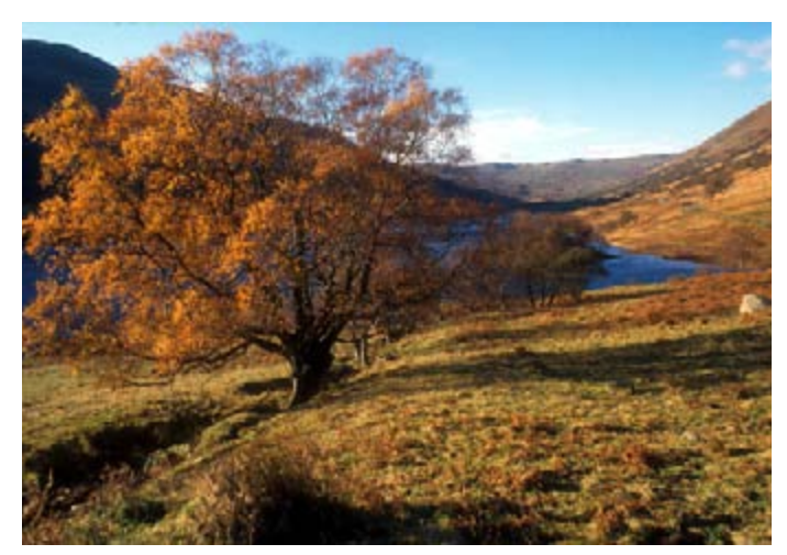
Glen Finglas, pollarded oak