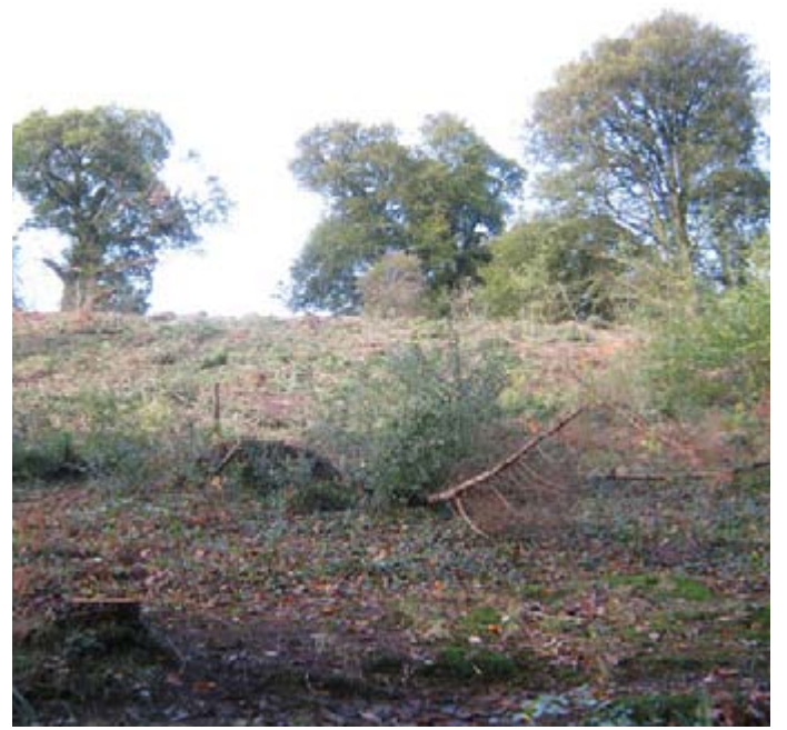
Ethy Park from base - after