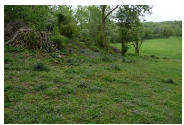
A recently cleared glade next to coppiced woodland

In south-west Wales, The Grasslands Trust is steward of possibly the only example of wooded meadow in the UK, and is carrying out work to restore this fascinating mosaic of habitats.