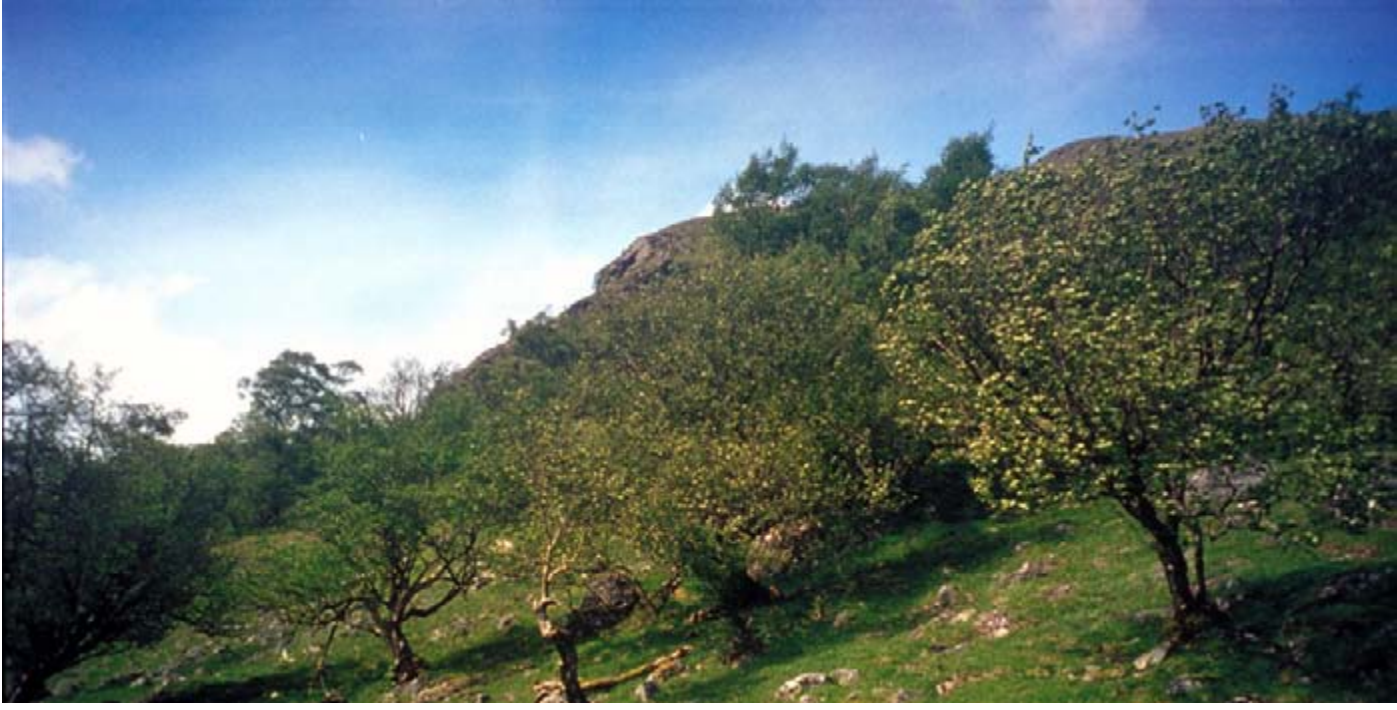
Glen Finglas, wood pasture

Renowned woodland ecologist George Peterken has been to Carmel on several occasions. He recently visited and commented that Carmel may be the only UK example of wooded meadow habitat. Wooded meadows are an internationally important habitat, recognised in the EC Habitats Directive. They comprise small grasslands mown for hay within a larger woodland matrix, with scattered pollards; sometimes the meadows are also grazed. Woodmeadows are mostly found in Sweden and Estonia. Carmel is different in that there are almost no pollards, other than boundary trees.