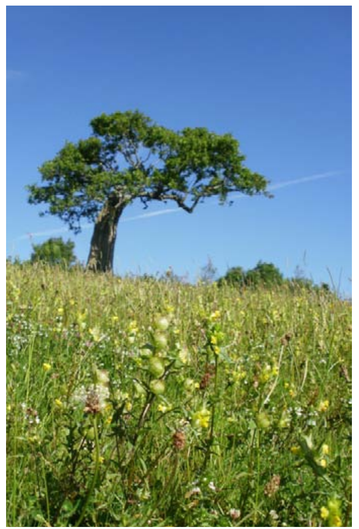
Green Castle, yellow rattle field